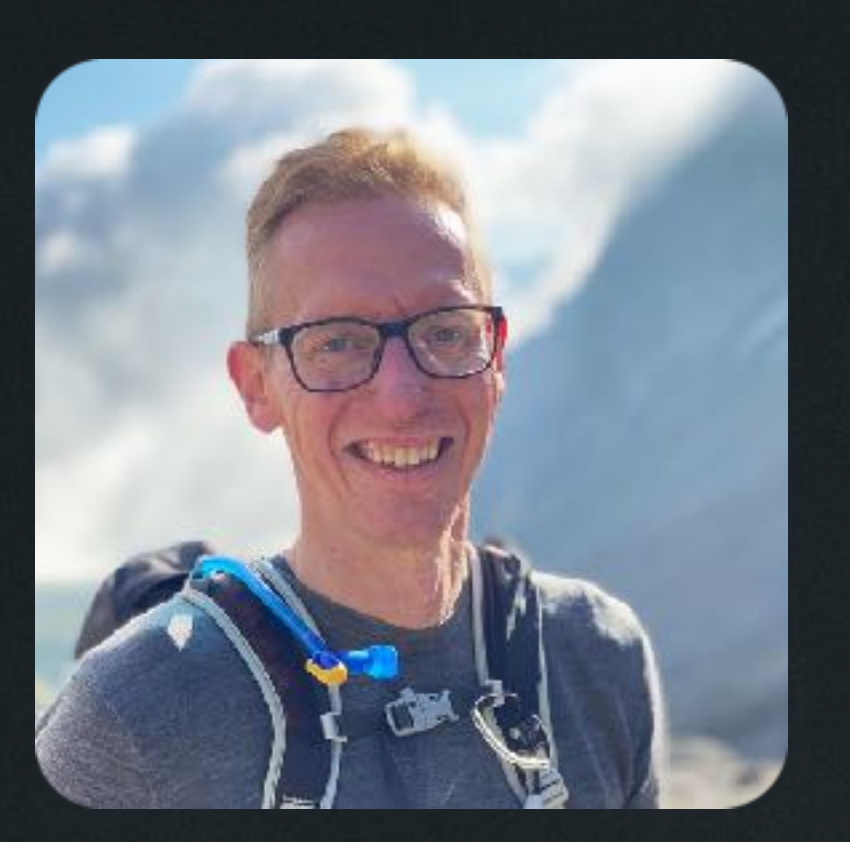
DISCLAIMER: NERD GONE SOFT