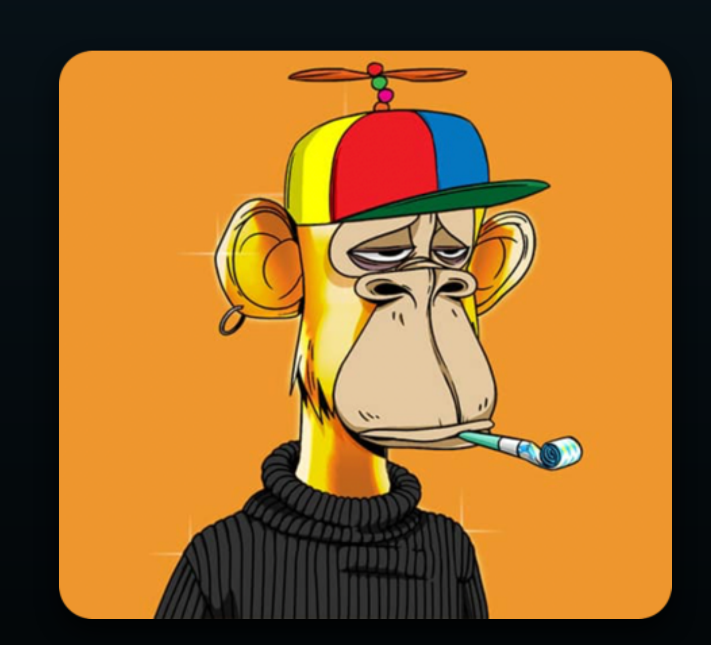
$3,400,000 USD BAYC FLOOR PRICE: $300,000 USD

OWNING AN NFT DOES NOT EQUATE TO OWNING THE COPYRIGHT, UNLESS STATED IN THE SMART CONTRACT